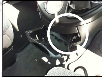
807 (CAN BUS)