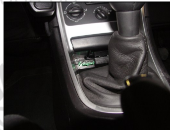
NEW 307 (CAN)