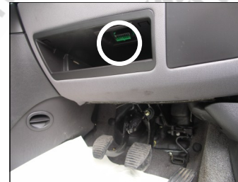
807 (NON CAN)